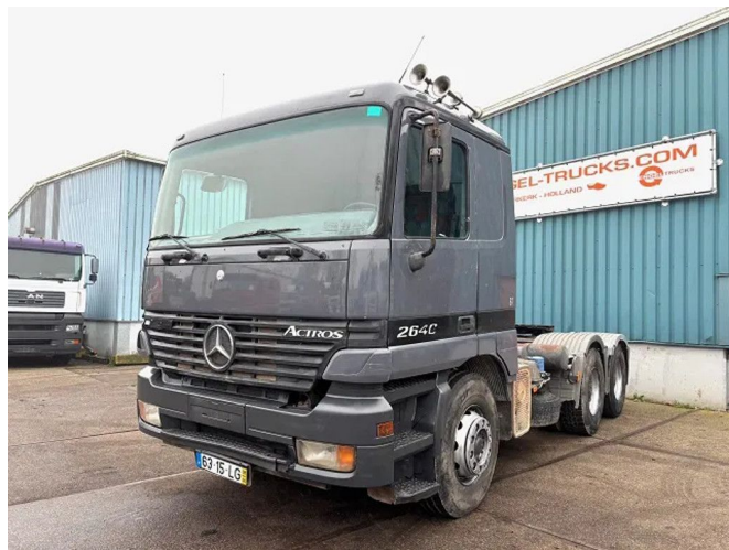
Mercedes-Benz Actros 2640 S 6x4 FULL STEEL TRACTOR ...